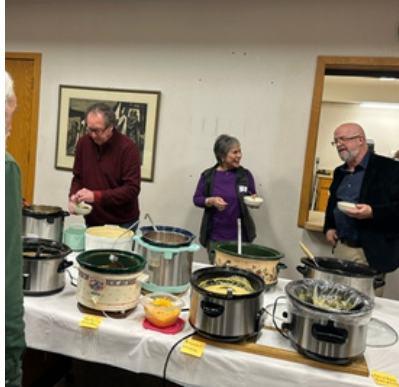
Lent projects left to right: "The Sin Bin," Lenten Service Project, altar and Communion, ecumenical soup supper